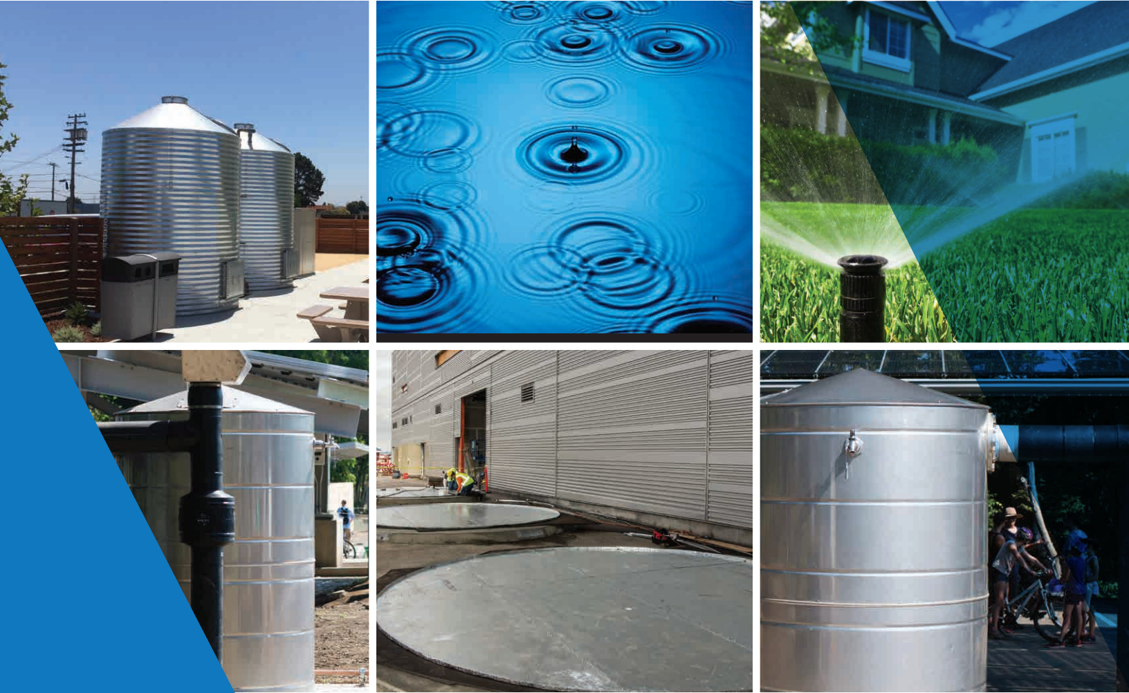
RainCycle™ Rainwater Harvesting System

Leading The Way With Sustainable Water Solutions